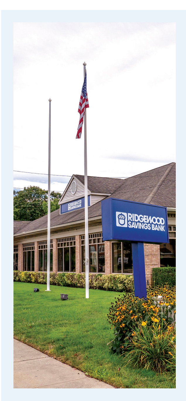
Stay tuned : We're looking forward to joining our Long Island neighbors in commemorating the 25th anniversary of our Lindenhurst branch in 2025.

We're thankful for the opportunity to enhance our support for Westchester residents by offering personalized service in a modern, convenient space.